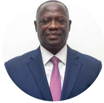
HON. EMMANUEL ARMAH-KOFI BUAH, MP Minister – Ministry of Lands & Natural Resources